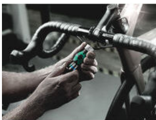
Stubby Ratchet Screwdriver with Bit Magazine