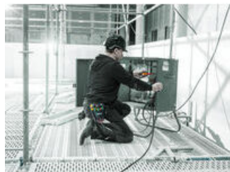
Screwdriver sets in belt holster