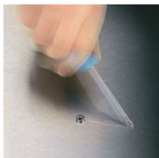
It happens time and time again that the tip slips out of the screw head when screwdriving, sometimes damaging valuable surfaces or even causing injury. The tips of the Wera Lasertip screwdrivers are microscopically roughened by means of a laser. This rough surface literally "bites" itself firmly into the screw head. Slipping out becomes a thing of the past.