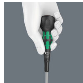
The ergonomically shaped Kraftform Ball-Grip fits perfectly in the hand. Its convex shape allows the transmission of high torques.