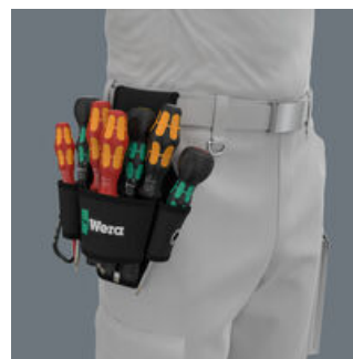
The belt pouch is made of robust material and can be attached to the belt.