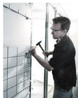
The Wera chiseldriver for screwdriving, chiseling, mortising and slackening stuck screws. With multi-component Kraftform handle for fast and smooth work.