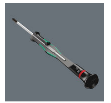
Multi-component screwdriver handle for ergonomic working.