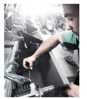
Screwdriving jobs in electrical and precision engineering applications are often tedious and timeconsuming. We learned from users what is important for them: working speeds, torque, precision - and we then focused particularly on these issues.