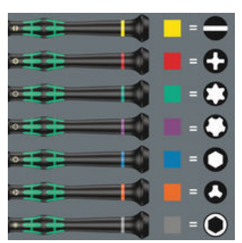
Screwdrivers with "Take it easy" tool finder: colour coding according to profile and size stamp.