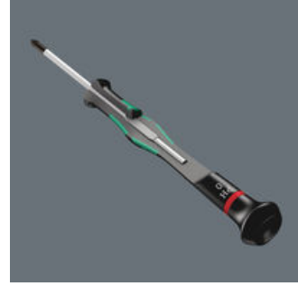
Multi-component screwdriver handle for ergonomic working.