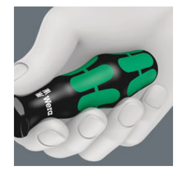
The outstanding design of the Kraftform handle that fits perfectly into the hand prevents hand injuries such as blisters and calluses.