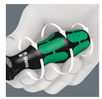
The hard materials used for the handle ensure rapid hand repositioning without any danger of the skin "sticking" to the handle. The surrounding hard zones with large diameters glide like wheels through the hand.