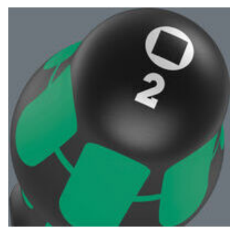
The screw symbol and tip size identification markings on the handle make it easier to find the right screwdriver in the tool case, or at the workplace.