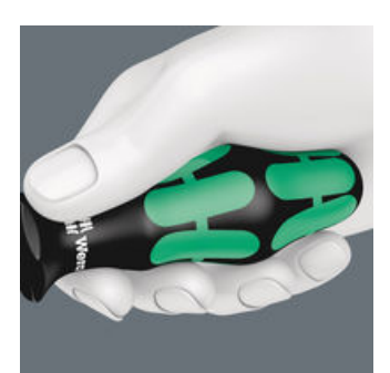
The large contact area - with particularly high friction to the soft zones - results in high torque transfer without any bruising from the edges.