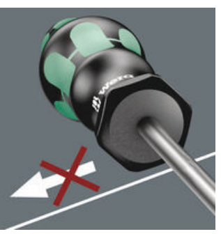
The hexagonal non-roll feature prevents any rolling away at the workplace.