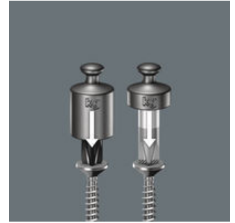
Reduced contact pressure

Wera Lasertip reduces the contact pressure required and enhances force transfer - meaning less screwdriving effort is required. Screwdriving becomes safer and easier.