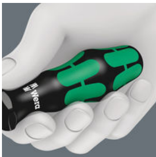
Prevents hand injuries

The outstanding design of the Kraftform handle that fits perfectly into the hand prevents hand injuries such as blisters and calluses.