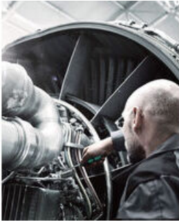
Lasertip prevents slipping out

Kraftform Plus screwdrivers - ergonomics you can grasp. They relieve the entire hand-arm system even when used intensively. Along with other technical and product advantages such as the Lasertip for a secure fit in the screw head, Kraftform screwdrivers are the ideal choice whenever manual screwdriving jobs are concerned.