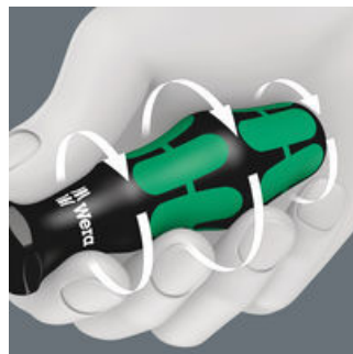
Rapid hand repositioning

The hard materials used for the handle ensure rapid hand repositioning without any danger of the skin "sticking" to the handle. The surrounding hard zones with large diameters glide like wheels through the hand.