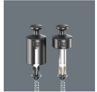
Reduced contact pressure

Wera Lasertip reduces the contact pressure required and enhances force transfer - meaning less screwdriving effort is required. Screwdriving becomes safer and easier.