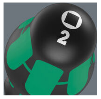
The screw symbol and tip size identification markings on the handle make it easier to find the right screwdriver in the tool case, or at the workplace.