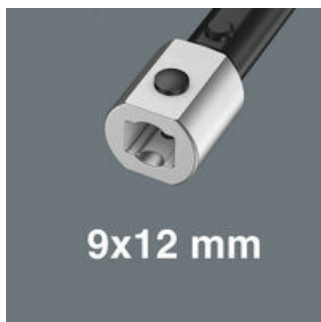
Chrome vanadium steel

For torque wrenches from the Click-Torque X series with 9x12 mm mounting.