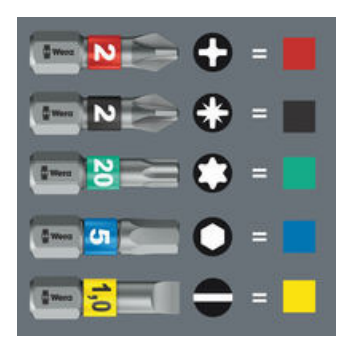
"Take it easy" tool finder with colour coding according to profiles and size stamp - for simple and rapid accessing of the required tool.