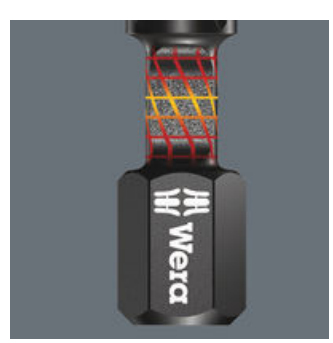
Torsion zone specially designed to absorb such forces and thereby protect the bit tip.