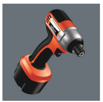
For use with impact screwdrivers. Improve productivity when screwdriving with power tools.

For an above-average service life. Maximum utilisation of the material properties, a very special geometry - designed particularly to meet the extreme demands - as well a specific manufacturing process mean that Wera Impaktor tools have an above-average service life. Another product advantage is the coating of the Impaktor bits with minute diamond particles. These diamond particles reduce the cam-out effects particularly high in power tool applications - which can lead to a slipping out of the screw head. The diamond particles literally bite themselves into the screw recess. This means that less contact pressure is required, something that greatly delays fatigue settingin in power tool screwdriving jobs.