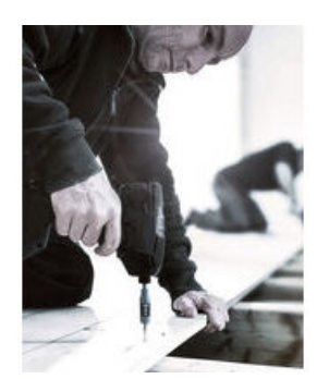
Impaktor technology for an aboveaverage service life even under extreme demands