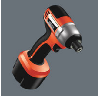
For use with impact screwdrivers. Improve productivity screwdriving with power tools.