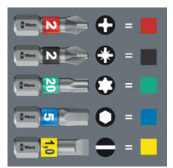
"Take it easy" tool finder with colour coding according to profiles and size stamp - for simple and rapid accessing of the required tool.