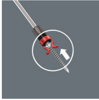
And this is how the gripper works

Attach the screw to the tip of the blade and secure it in the screw gripper.