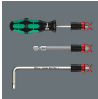
And this is how the gripper works

The screw gripper attachment can also be used with L-keys and long bits!