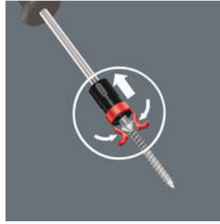
And this is how the gripper works

Pull the screw gripper towards the screwdriver handle until the two arms of the gripper sit against the head of the screw and are spread slightly apart. The Wera screw gripper releases the screw automatically after it has been fastened.