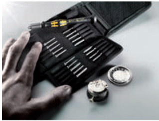
Kraftform Micro ESD bit holder