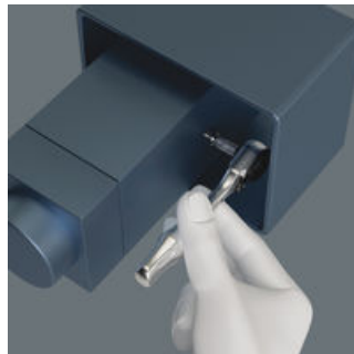
For all difficult-to-access applications.