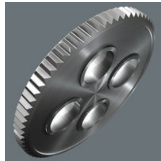
The fine tooth mechanism, with its 60 teeth, allows a small return angle of only 6° - ideal for precision work.