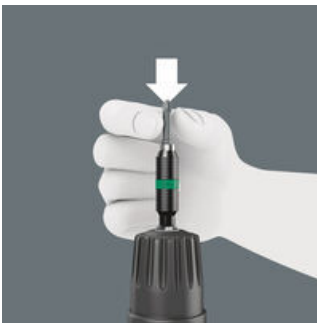
Rapid-in and self-lock

The bit can be pushed into the adaptor without moving the sleeve. The lock is activated automatically as soon as the bit is applied to the screw. Bits are held securely and wobble-free.