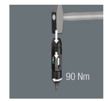
The double-curved design is particularly efficient.