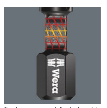
Torsion zone specially designed to absorb such forces and thereby protect the bit tip.