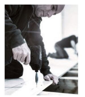
Impaktor technology for an aboveaverage service life even under extreme demands