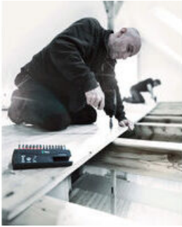
Impaktor holder with ring magnet

Impaktor technology for an above-average service life even under extreme demands