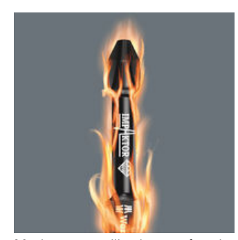
Maximum utilisation of the material properties, a very special geometry - designed particularly to meet the extreme demands - as well a specific manufacturing process mean that Wera Impaktor tools have an above-average service life.