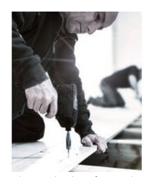
Impaktor technology for an aboveaverage service life even under extreme demands