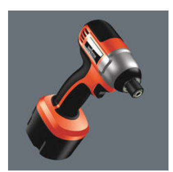
For use with impact screwdrivers. Improve productivity when screwdriving with power tools.