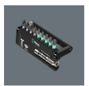
The Bit-Checks can be positioned upright at the workplace so the tool is always quickly to hand.