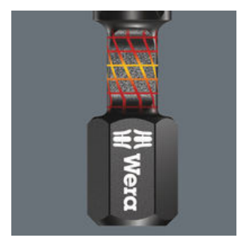
Torsion zone specially designed to absorb such forces and thereby protect the bit tip.