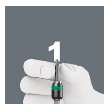
Every function of the Rapidator quick-release chuck, such as inserting or releasing bits, can be carried out with one hand. This is faster, more economical and more ergonomic. There are no unnecessary manoeuvres.