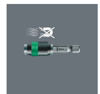
Non-magnetic bitholders that do not attract metal filings.