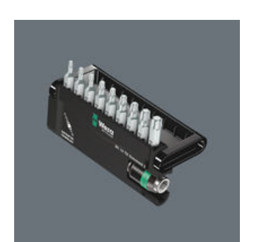
The Bit-Checks can be positioned upright at the workplace so the tool is always quickly to hand.