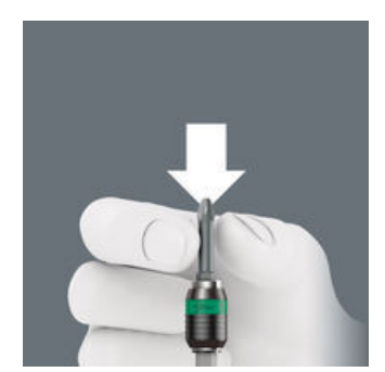
The bit can be pushed into the adaptor without moving the sleeve. The lock is activated automatically as soon as the bit is applied to the screw. Bits are held securely and wobble-free.