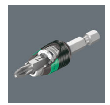
Rapid bit change without needing any additional tools. One-hand operation with a freely spinning sleeve for simplified guidance of the tool.