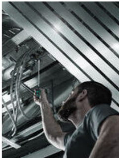
Secure hold and easy removal

The 300 mm long blade makes it possible to reach even low lying couplings.