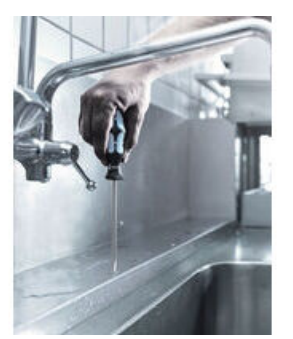
Screw stainless steel together with stainless steel!