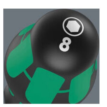
The screw symbol and tip size identification markings on the handle make it easier to find the right screwdriver in the tool case, or at the workplace.

Web link https://products.wera.de/en/screwdrivers_kraftform_plus__series_300_395_ho.html