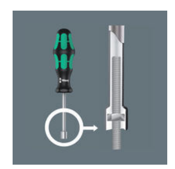
A screwdriver with a hollow shaft is needed whenever there are screwdriving jobs involving threaded rods i.e. the threaded rod through the nut can slip into the hollow shaft of the screwdriver.