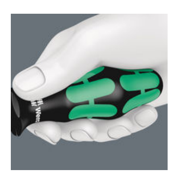
The large contact area - with particularly high friction to the soft zones - results in high torque transfer without any bruising from the edges.