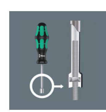
A screwdriver with a hollow shaft is needed whenever there are screwdriving jobs involving threaded rods i.e. the threaded rod through the nut can slip into the hollow shaft of the screwdriver.