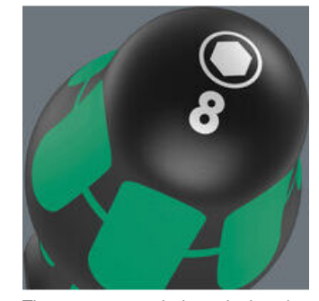
The screw symbol and tip size identification markings on the handle make it easier to find the right screwdriver in the tool case, or at the workplace.