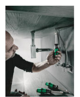
Hollow shaft for protruding threaded rods