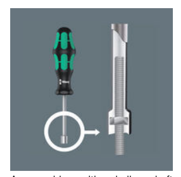
A screwdriver with a hollow shaft is needed whenever there are screwdriving jobs involving threaded rods i.e. the threaded rod through the nut can slip into the hollow shaft of the screwdriver.