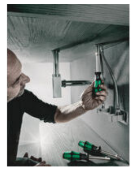
Hollow shaft for protruding threaded rods