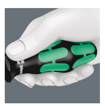
The large contact area - with particularly high friction to the soft zones - results in high torque transfer without any bruising from the edges.