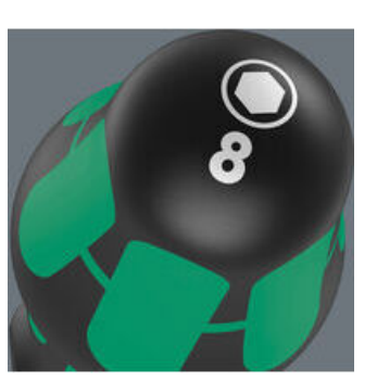
The screw symbol and tip size identification markings on the handle make it easier to find the right screwdriver in the tool case, or at the workplace.

Web link https://products.wera.de/en/screwdrivers_kraftform_plus__series_300_395_ho.html