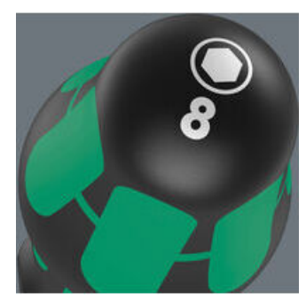
The screw symbol and tip size identification markings on the handle make it easier to find the right screwdriver in the tool case, or at the workplace.