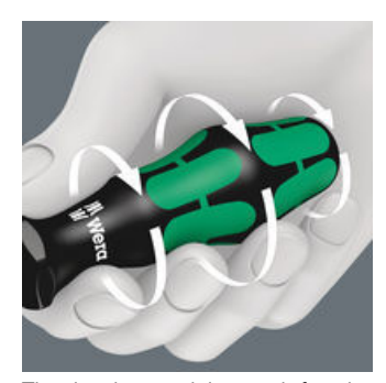
The hard materials used for the handle ensure rapid hand repositioning without any danger of the skin "sticking" to the handle. The surrounding hard zones with large diameters glide like wheels through the hand.