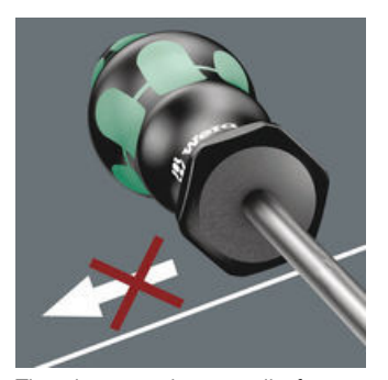
The hexagonal non-roll feature prevents any rolling away at the workplace.