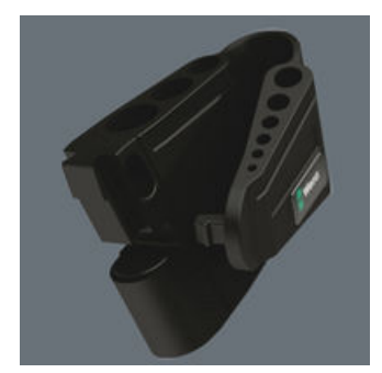
The wear-resistant clip material ensures that the L-keys are securely held yet are easy to remove.