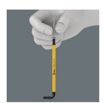
In tight assembly or disassembly situations, for example in engine compartments, it is not possible to securely hold the screw with the hand on the screwdriver, and the screw subsequently often gets lost. Lengthy searches or the loss of the screw (with the associated danger that could bring about) are the consequence. The HF tools developed by Wera are ideal because they feature an optimised geometry of the original TORX® profile. The wedging forces from the surface resulting pressure between the drive tip and the screw profile mean that the screw is securely held on the tool!