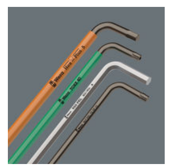
The size of each L-keys has been engraved by a laser. In addition Take it easy L-keys have a colour coding according to sizes - for simple and rapid accessing of the required tool. Making it easy to find the right tool.