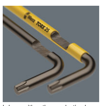
L-keys with a thermoplastic sleeve are manufactured out of easy-togrip, circular material. The sleeve ensures that work is safe and comfortable even at low temperatures. High corrosion protection features thanks to the special BlackLaser surface treatment. Colour coding and large stamp to enable the desired L-key to be easily located.