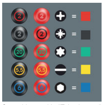
Screwdrivers with "Take it easy" tool finder: colour coding according to profile and size stamp.