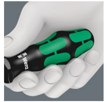
The outstanding design of the Kraftform handle that fits perfectly into the hand prevents hand injuries such as blisters and calluses.

The basic idea for the prototype of the Kraftform handle - that the hand should dictate the design has, right through to today, proved to be correct. In cooperation with the internationally recognised Fraunhofer IAO Institute, Wera developed a screwdriver handle designed to match the shape of the human hand as long ago as the 1960s. After a long development phase, the Wera Kraftform handle was launched to the market in 1968. It has been optimised through the years with new technologies, but has kept its proven shape. After all, the human hand has not changed either.