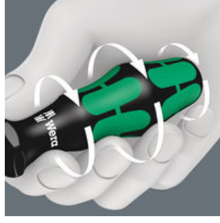
The hard materials used for the handle ensure rapid hand repositioning without any danger of the skin "sticking" to the handle. The surrounding hard zones with large diameters glide like wheels through the hand.