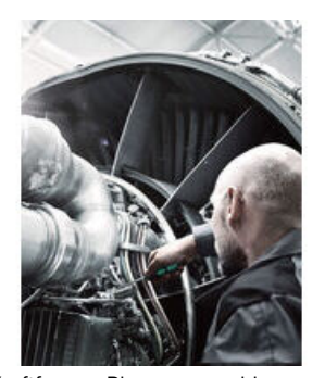
Kraftform Plus screwdrivers ergonomics you can grasp. They relieve the entire hand-arm system even when used intensively. Along with other technical and product advantages such as the Lasertip for a secure fit in the screw head, Kraftform screwdrivers are the ideal choice whenever manual screwdriving jobs are concerned.