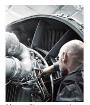
Kraftform Plus screwdrivers ergonomics you can grasp. They relieve the entire hand-arm system even when used intensively. Along with other technical and product advantages such as the Lasertip for a secure fit in the screw head, Kraftform screwdrivers are the ideal choice whenever manual screwdriving jobs are concerned.