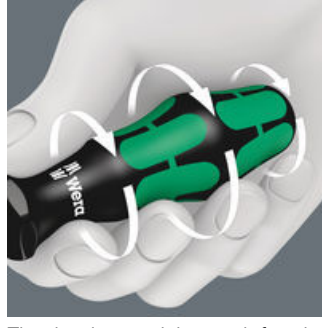
The hard materials used for the handle ensure rapid hand repositioning without any danger of the skin "sticking" to the handle. The surrounding hard zones with large diameters glide like wheels through the hand.