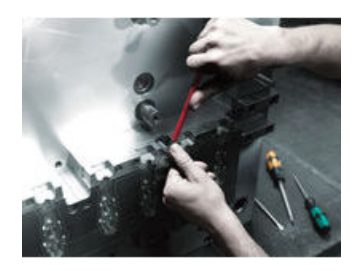
We questioned the classic L-key design, since all too often the screw head recess is rounded out, meaning screws can no longer be tightened or loosened - and so the user finds the L-key slipping out of the recess. Wera Hex-Plus tools have a larger contact surface in the screw head. The notching effects are reduced and thereby the deformation of the screws. At the same time, as much as 20 % more torque can be applied.