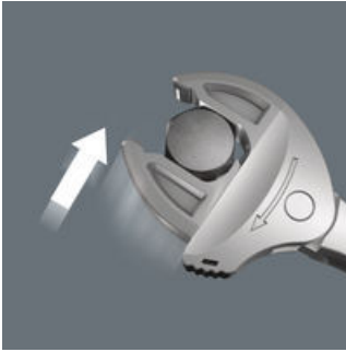
Joker 6006: automatically and continuously self-setting

With its automatically and continuously gripping parallel jaws, the Joker 6006 double spanner covers all dimensions within the potential operative range. The tool finds the required size by itself when attaching it to the bolt or screw.