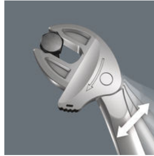
Joker 6006: ratchet mechanism for quick working

The ratchet functionality in both jaws of the double spanner ensures fast and consistent screwdriving without removing the tool.