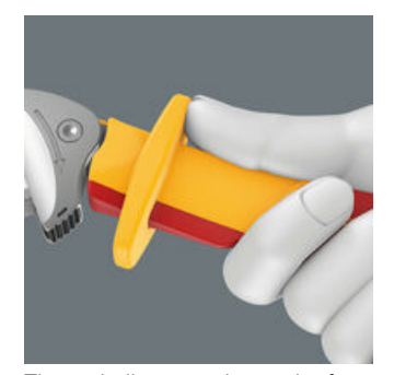
The anti-slip protection at the front end of the handle ensures a secure hold and prevents your hand from accidentally slipping forward.