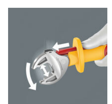
The sliding function allows contactless and safe opening of the non-insulated jaws.