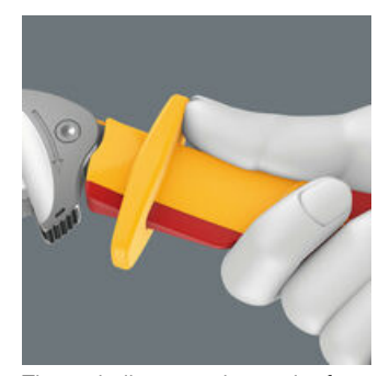
The anti-slip protection at the front end of the handle ensures a secure hold and prevents your hand from accidentally slipping forward.