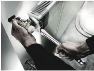
Joker 6004: Automatically and continuously self-setting