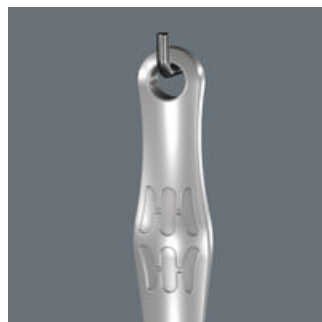
Joker 6004: Useful hole for hanging

Thanks to its hole the Joker can be neatly hung on the workshop wall.