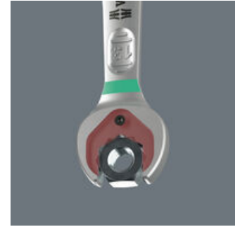
Ring ratchet spanner Joker 6000

The Joker's holding function means that nuts and bolts can be held in the jaw and easily positioned where they are needed. Fastening on to the thread can then be done quickly and safely, thanks to the innovative special stop-plate which holds the fastener. No more time-wasting searches for dropped nuts and bolts! After applying and positioning the nut or bolt, fastening can begin immediately - no additional tools required.