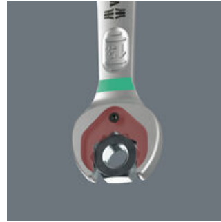
Joker 6000 ring ratchet spanner

The Joker's holding function means that nuts and bolts can be held in the jaw and easily positioned where they are needed. Fastening on to the thread can then be done quickly and safely, thanks to the innovative special stop-plate which holds the fastener. No more time-wasting searches for dropped nuts and bolts! After applying and positioning the nut or bolt, fastening can begin immediately - no additional tools required.