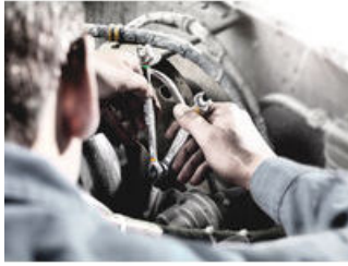
Joker open-ended wrench

The ratcheting feature at the ring end boasts an exceptional, fine tooth mechanism - 80 teeth in all - which provides greater flexibility, even in very confined working spaces.