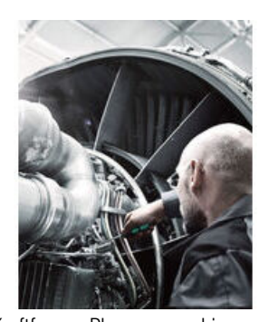
Kraftform Plus screwdrivers ergonomics you can grasp. They relieve the entire hand-arm system even when used intensively. Along with other technical and product advantages such as the Lasertip for a secure fit in the screw head, Kraftform screwdrivers are the ideal choice whenever manual screwdriving jobs are concerned.