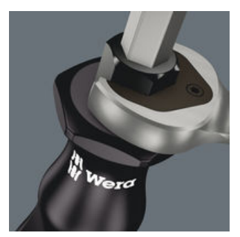
Hexagonal blade and bolster for higher torque transfer.

Further versions in this product family: