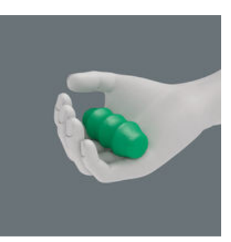
The basic idea for the prototype of the Kraftform handle - that the hand should dictate the design has, right through to today, proved to be correct. In cooperation with the internationally recognised Fraunhofer IAO Institute, Wera developed a screwdriver handle designed to match the shape of the human hand as long ago as the 1960s. After a long development phase, the Wera Kraftform handle was launched to the market in 1968. It has been optimised through the years with new technologies, but has kept its proven shape. After all, the human hand has not changed either.

Further versions in this product family: