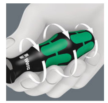
The hard materials used for the handle ensure rapid hand repositioning without any danger of the skin "sticking" to the handle. The surrounding hard zones with large diameters glide like wheels through the hand.