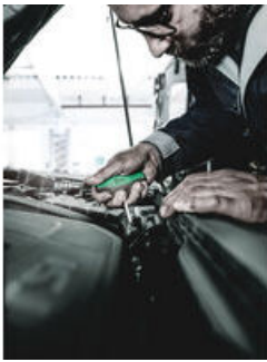
Screwdrivers with T-handle