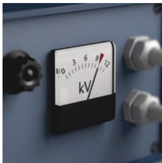
The individual testing of the Zyklus tools for electricians at 10,000 volts, in accordance with IEC 60900, guarantees safe working under voltages up to 1,000 volts.