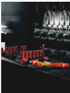
Zyklus ratchet and accessories for Electricians