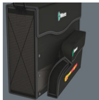
The textile box of the ratchet set 8100 SB VDE 1 is suitable for attachment to wall, shelf, workshop trolley and the Wera 2go system due to its back located hook and loop fastener strip.