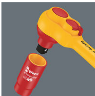
The ball lock ensures sockets and accessories fit securely, providing increased safety during operation. A short press on the release button allows the tool to be changed quickly.