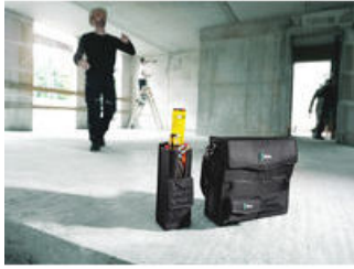
Wera 2go 7 high tool box.