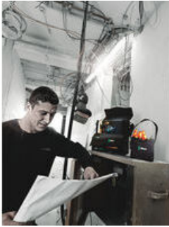
Wera 2go 4 Tool Quiver