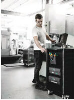
Wera 2go 4 Tool Quiver